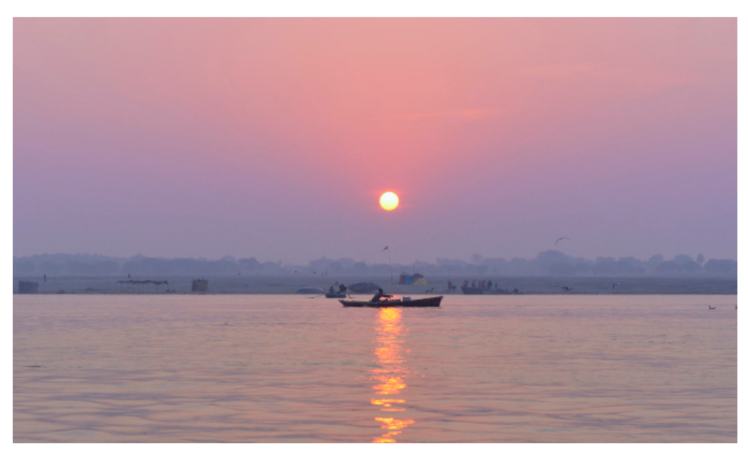
It is critical to identify the primary challenges facing the nation's competitiveness, which, if conquered, will propel the nation to a higher stage of development

reasons behind this is the misallocation of resources in an economy due to interference in the supply-demand dynamic. In essence, it occurs when a country's economy underutilises its own potential.