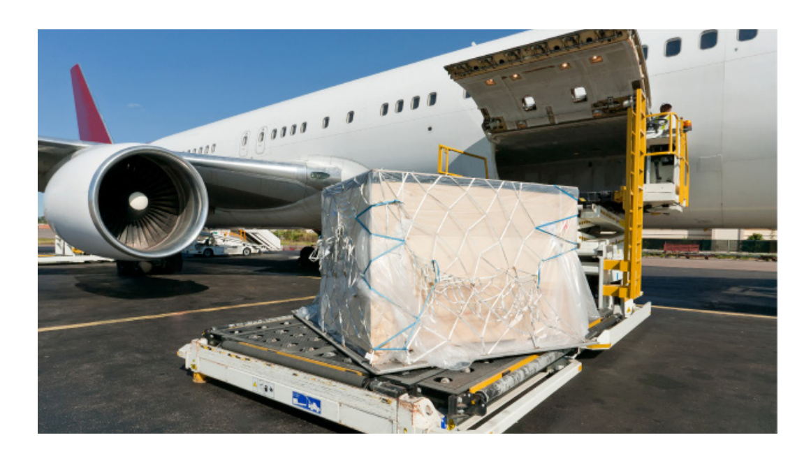
In 2020–21, the combined share of Gujarat, Tamil Nadu and Maharashtra constituted around 60 per cent of the country's total exports. There is immense potential for India to boost exports by activating dormant capacities at the sub-national level

but all of society, and will continue to do so, is climate change. It has become imperative for countries to make climate change an integral component of policy discussions. The decade spanning 2011-2020 has been the warmest on record, as the world grapples with potential extreme weather events, food scarcity, and the resultant poverty and displacement. While there is no simplistic solution to this issue, one of the opportunities that India can leverage is investment in climate resilient infrastructure.